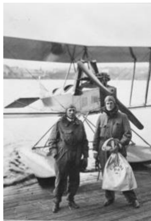
March 1, 1919, Bill Boeing (holding the mailbag at right) and Eddie Hubbard flew the first international mail flight from Seattle, Washington, to Vancouver, British Columbia, in the Boeing Model C, the company's first production airplane.

Starliner's flight test campaign also is setting the company on a path for commercial spaceflight similar to the path Bill Boeing began in 1916, when his aircraft company produced its first airplane and followed it up soon after with aircraft designed to meet the needs of the U.S. Air Mail service.